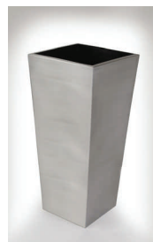
Custom Tapered Planter