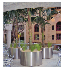
1500 dia x 1000 h mm