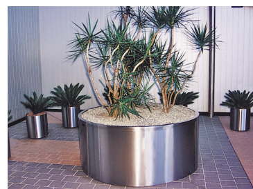
2500 dia x 750 h mm