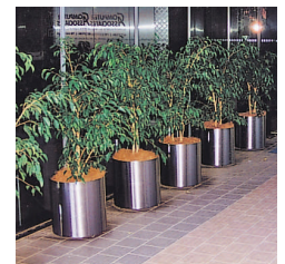
400 dia x 400 h mm