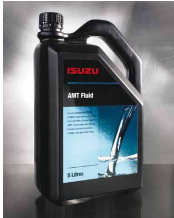
AMT FLUID A unique formulation ATFIII (3) designed specially for use in Isuzu Automated Manual Transmission (AMT) fluid coupling wet clutches. Provides excellent temperature stability under high stress loads.