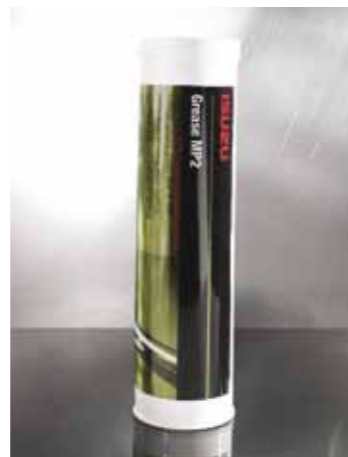
GREASE MP2 Isuzu Grease MP2 is recommended for wheel bearings and highly stressed bearings in all vehicles if an extension of greasing intervals is required. Isuzu Grease MP2 improves wear protection.

5 LITRES 92955193 20 LITRES 92955194 205 LITRES 92955196