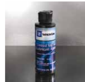
LSD ADDITIVE Friction modifier designed to be used with Isuzu Trans 85/140 for all Isuzu limited slip differential applications.