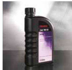
CAB TILT OIL Zinc-free hydraulic fluid suitable for all Isuzu Cab-tilt applications.

1 LITRE 92955040 5 LITRES 92955041 20 LITRES 92955042