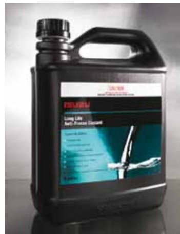
LONG LIFE ANTI-FREEZE COOLANT Isuzu Long Life Anti-Freeze Coolant offers superior aluminium corrosion protection and heat transfer properties, is anti-foaming and can be readily mixed with good quality water.

1 LITRE 92955040 5 LITRES 92955041 20 LITRES 92955042