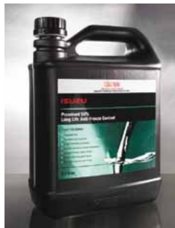
PRE-MIXED ANTI-FREEZE COOLANT Isuzu Premixed 50% Long Life Anti-Freeze Coolant offers superior aluminium corrosion protection and heat transfer properties.

5 LITRES 92955193 20 LITRES 92955194 205 LITRES 92955196