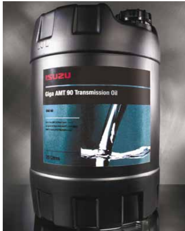
GIGA AMT 90 TRANSMISSION OIL Mono-grade gear oil designed specifically for Automated Manual Transmissions (AMT) in heavy duty Giga applications.