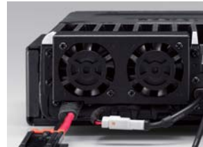
Optional CFU-F8100 fitted to the rear panel.