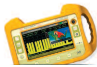
HD RANGER Eco